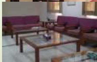
DU International Guest House (Top)