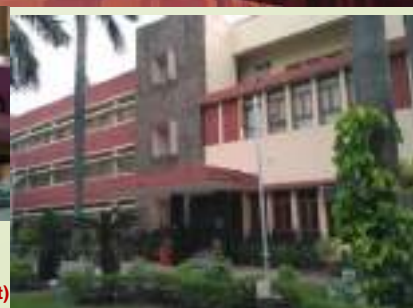
DU University Guest House (Right)